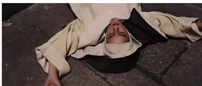
Figure 4. Subtitle: “Have you no faith in the power of our holy Mother Church?” (93’01”)

Baptism is the chief sacrament of the forgiveness of the Original Sins, it united us to Jesus, and gave us the Holy Spirit. By the time we thank Jesus, our physical self has already been born with the original sin. However, Grenouille has no sense of guilt throughout his crime. Only after he saw the scattered plums was he aware that he had committed an offence. Actually, people lived their lives in bondage to pain and desire. It is unnecessary for us to control our reasonable desires in the modern society. Otherwise, our spirits will be incomplete and be damaged and distorted by original sin. Generally, we are facing with the unyielding faith in technology’s power to improve the future. With the rapid development of technology, perfume suggests the emergence of civilization diseases and spiritual beliefs. Actually, our brains have the creativity and imagination. From lack of experience to lack of confidence, our intelligence have many novel ways to overcome the difficulties by ourselves. Most people have a blind faith in the God in churches. Just like the movie plot, ironically, the nun who believe in God was be killed.