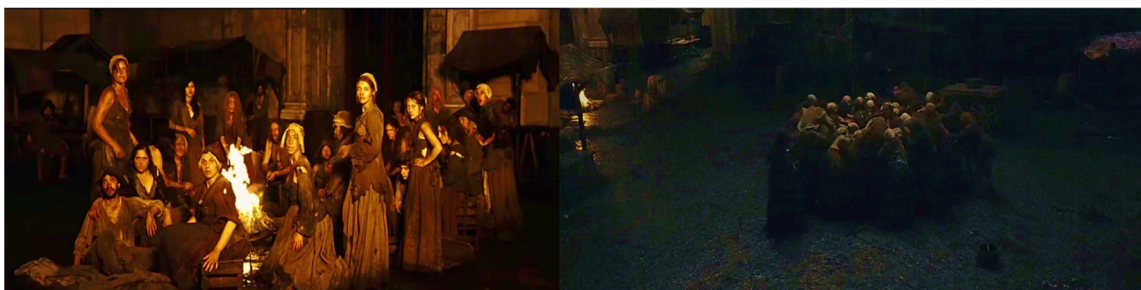
Figure 3. The case of cannibalism in the fish market ( Perfume )

The contrast of Light & Dark is used here to tell the story