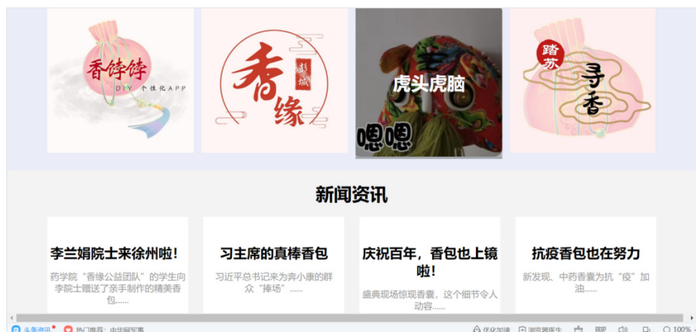
Figure 3. Website page