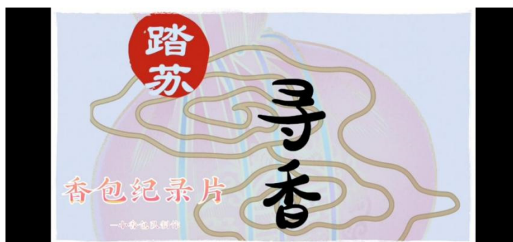
Figure 2. Documentary cover

The past and present life of Xuzhou sachets will be explained in this documentary. Through this documentary, we will tell about its historical origin-how the sachet appeared in the long history, the evolution history-the changes of sachets from ancient times to the present, the production process-how to make a beautiful sachet, the meaning of the theme- Each sachet of different shapes has different meanings. The appeal of a documentary is far greater than that of images and words, so that more people can see the culture of sachets vividly.