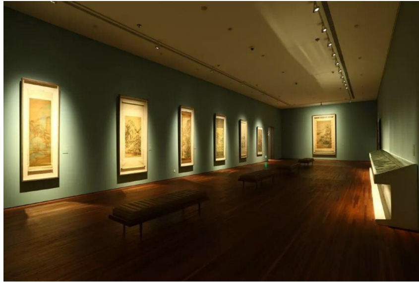
Figure 2. Case 1